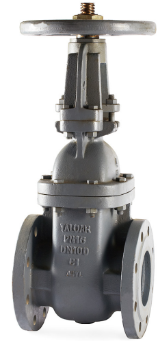
MG670-R 2" - 24"

Outside Screw and Yoke, Solid Wedge, Bronze Seat Design to BS5150 and MSS SP-70 Flange Dimension to EN1092-2, ANSI B16.1 Class 125